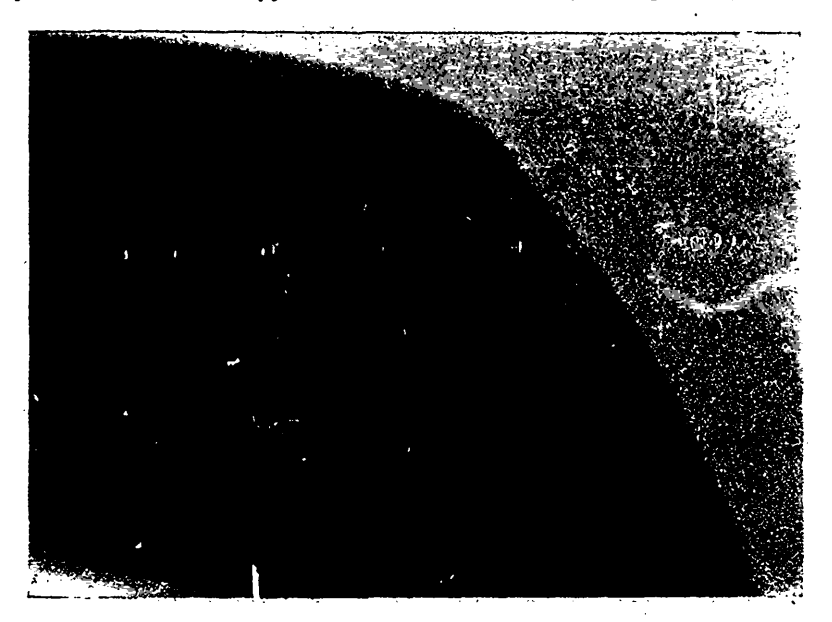
Fig. 2. Synovial Tuberculosis.

Nor is the diagnostic ability of the ray confined to tuberculous disease of the osteal and synovial structures alone. The chest, too, gives up some of its uncertainties. Here, however, with the exception of perhaps thoracic aneurism, radiography yields to fluoroscopy. On account of the prolonged exposure