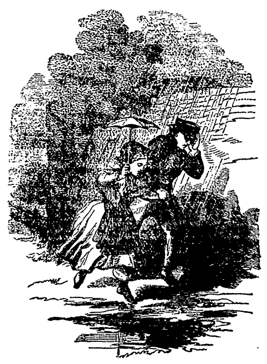
THE TWO CENTS.