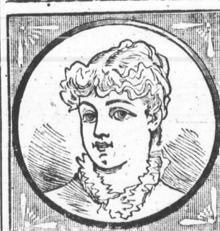
Portrait of a woman, likely related to the 'A Dream of Fair Women' article.

THIS ORIGINAL DOCUMENT IS IN VERY POOR CONDITION