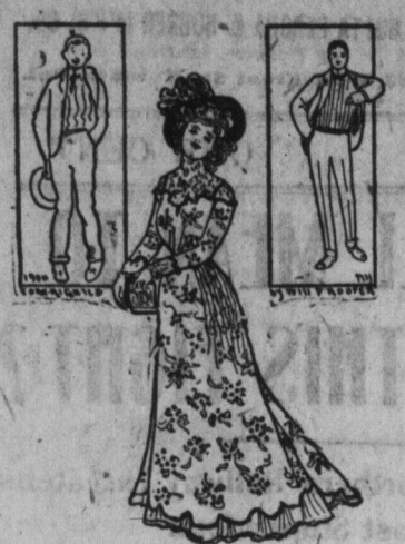
The ease of your pose depends upon your clothes.

The Woods are full this summer with young ladies armed with cameras. Will your clothes twist the lens or will they stand the test? A few dollars now buys a suit that will give you perfect composure and comfort, even at the camera's mouth.