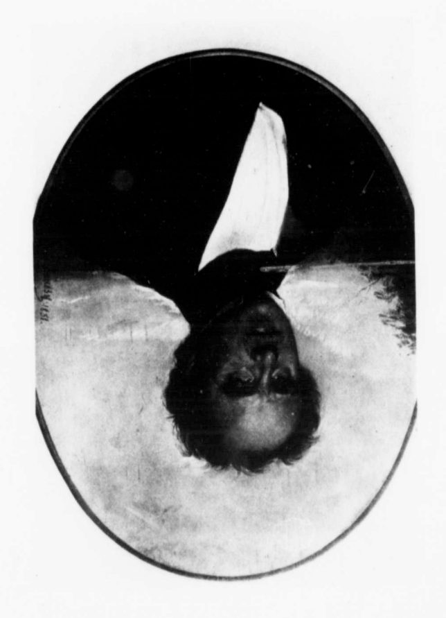
thom a painting by T Debaussy, London in 1851 and R HOWE