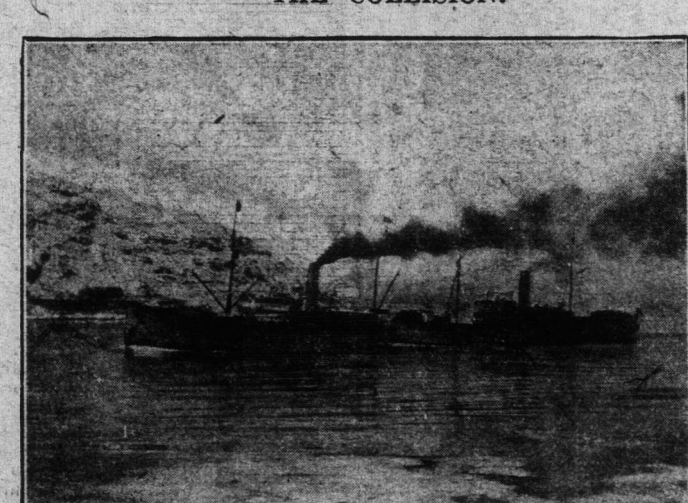
The Bonaventure and Beothic.