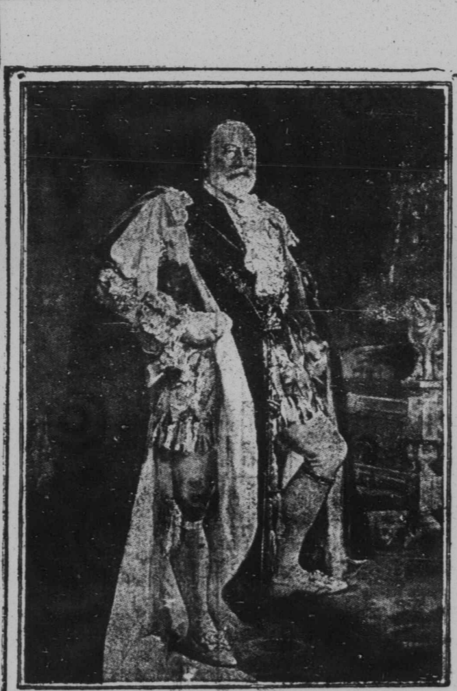
LATEST PORTRAIT OF KING EDWARD VII.

The new King, George Frederick Ernest Albert, was born at Marl-