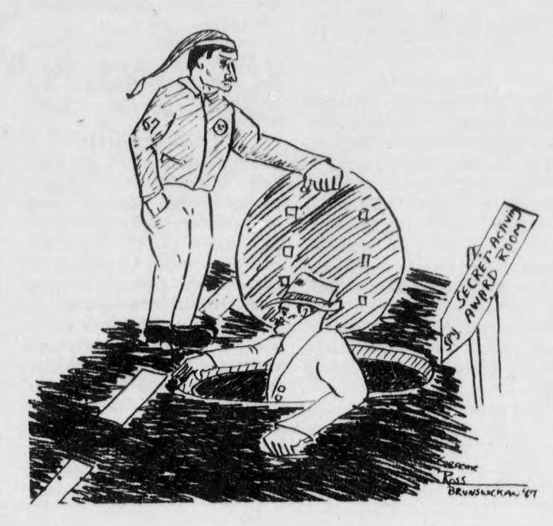
I'm the yo-yo. Have you got the points?