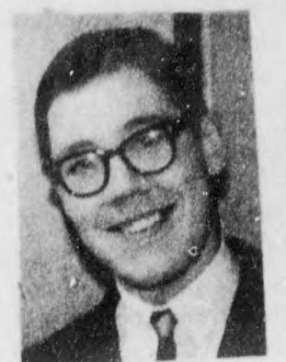
1ST. VICE PRESIDENT: ONE SEAT

Look Them Over - Take Your Choice Then VOTE Jan. 25