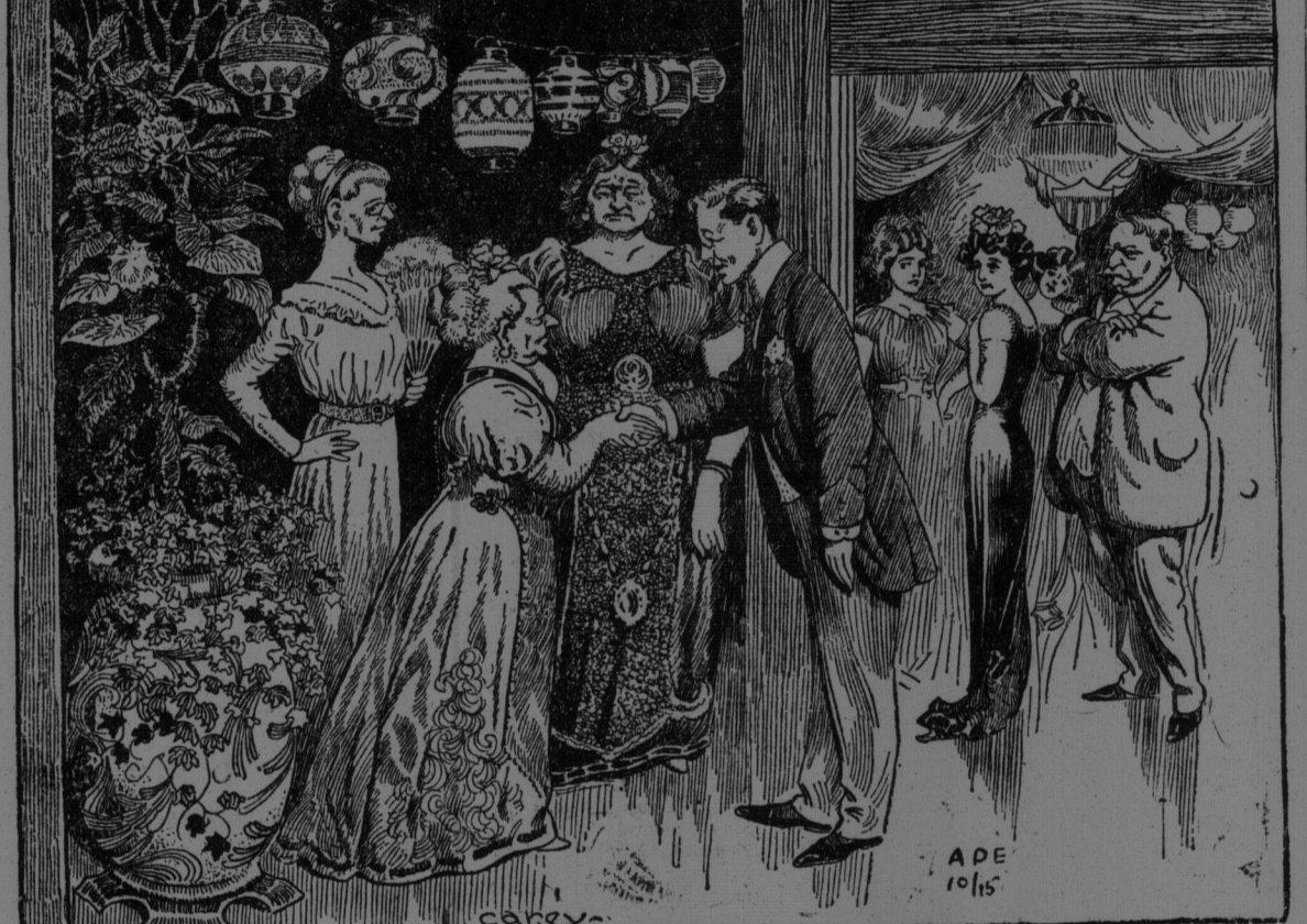
HE IGNORED THE DUOS AND DEBUTANTES AND WORKED OVERTIME TO SOLIDIFY HIMSELF WITH THE MATRONS.

THE 1911 FABLE OF HOW ALBERT FIRST ENDURED, THEN PITIED AND THEN SAT IN WITH THE MATRONS.