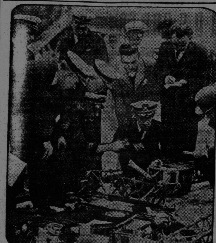
Members of the naval court investigating the Shenandoah tragedy made a minute examination of the wreckage of the ship in the hope of gaining some more information about the cause of the crash.