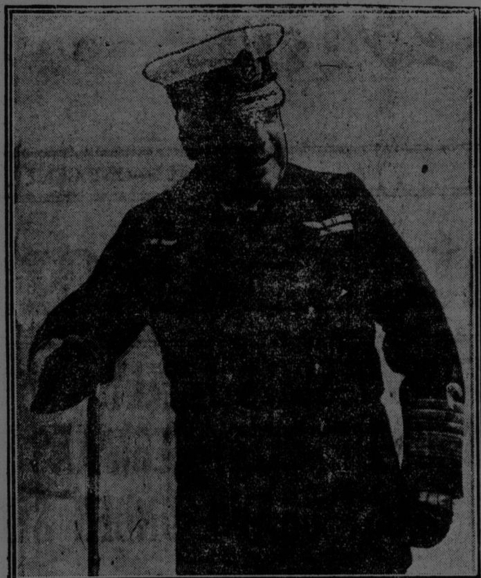
Rumors are that Admiral Lord Beresford will soon be actively employed in command of reserves in the North Sea. There is no confirmation of this, but the photograph taken at the age of a dandy as entering St. Paul's to the naval memorial service, shows that he has not lost his youthful cheerfulness and vigor.