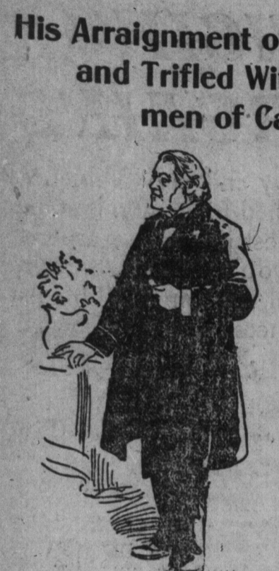
Sir Charles Tupper.

Sir Charles Tupper, on coming forward to address the great meeting in Windsor Hall, in Montreal, on Monday, was greeted with prolonged cheers, which prevented him speaking for five minutes. Finally, when the cheering had subsided, he spoke as follows:—