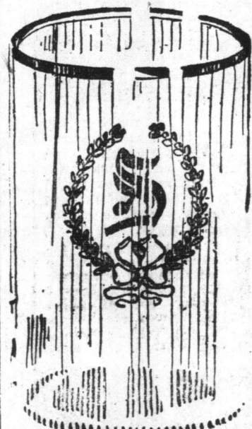
There Are Six Just Like This One in Each Set.

Rimmed and initialed within a filigree border in real silver—the thin-blown Tumbler Sets are taking the town by storm—every Exhibition visitor will want a set. CLIP THE COUPON AND PRESENT TODAY