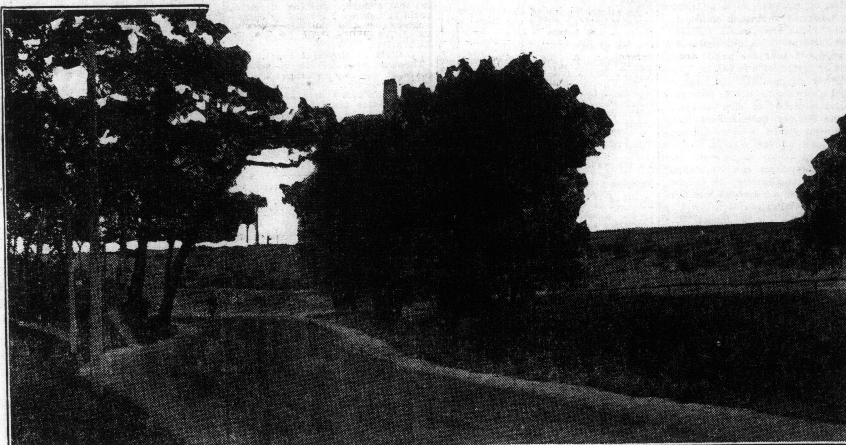
View of Lake Ontario from High Park. The lake is behind the mud wall. A similar mud wall on the Esplanade, with tunnels 230 feet long, or about four times the width of Yonge street, will shut out the view of the island and the bay.