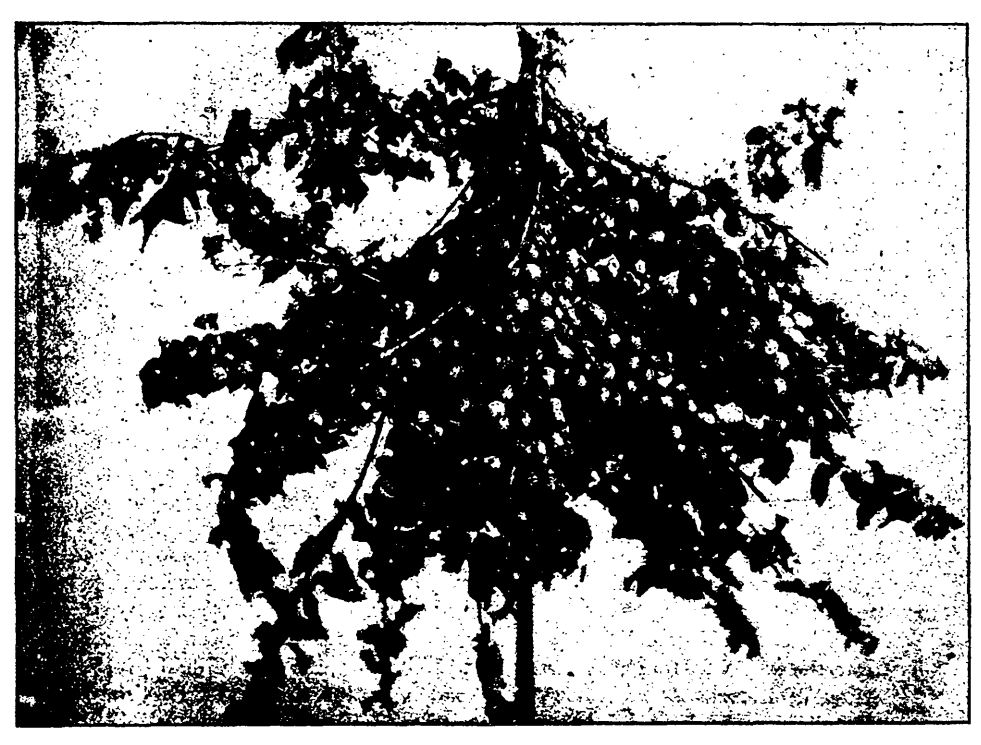
Fig. 76.-The Pearl Gooseberry-(Photo-graved for the Canadian Horticulturist.)