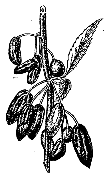
"PLUM POCKETS." Fig. 78.

All plums are more or less subject to the attacks of this parasite, but it is usually more abundant on the red and purple varieties. It occurs also