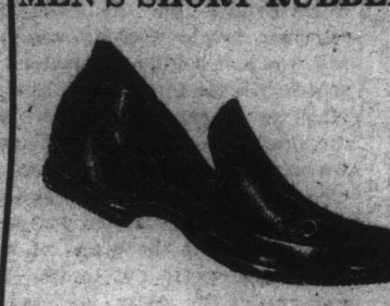
MEN'S LOW RUBBERS