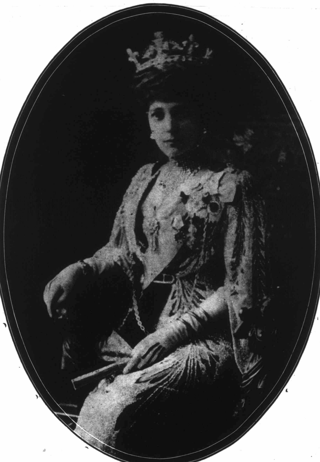
ON HER SIXTY-NINTH BIRTHDAY

quickly accomplished. But the same principles have to be carried into other and more subtle expressions of musical worship, into the singing of the actual offices of the Church, Responses, Psalms and Canticles, and there lie obstructions less easy to cope with. The simple process of massing choirs together for special occasions such as this cannot indeed cope with them; for that process necessarily makes impossible the flexibility of rhythm, the delicate adjustment of the musical phrase to the verbal phrase, which is essen-