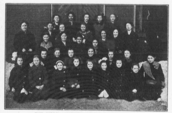
THE GIRLS' "MORNING HOUR," BOWMANVILLE.

In discussing How to Develop Young Life for Efficient Manhood and Woman-