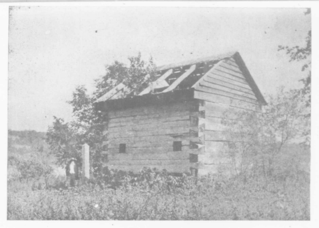
OLD BLOCK-HOUSE.—Once used as the Magazine, Magazine Island. (Side view.)