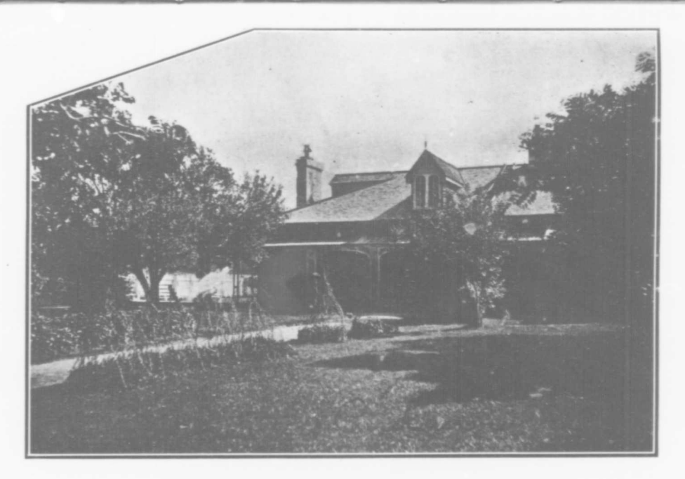
OFFICERS' QUARTERS.—Afterward a Private Residence.