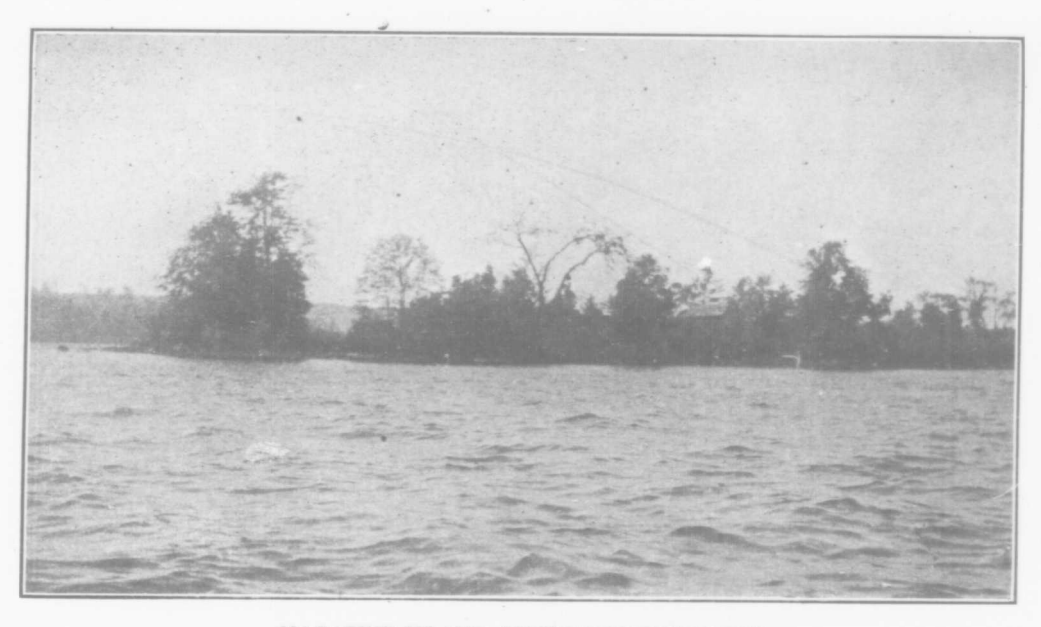
MAGAZINE ISLAND, PENETANGUISHENE BAY