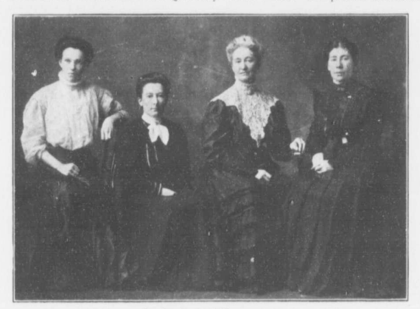
Ladies' Aid Executive

OR many years the women of the Methodist Church have been organized as a "Ladies' Aid" for purposes consisten with our divine mission. The material, social and spiritual life of the congregation has been strengthened, directed and developed by the skilful Christian ministries of the women of our Church. In the church and parsonage are to be seen evidences of the efficiency of this society. The Ladies' Aid is an integral part of the Methodist Church. The President, by virtue of her office, is a member of the Quarterly Official Board. The present membership is sixty-seven.