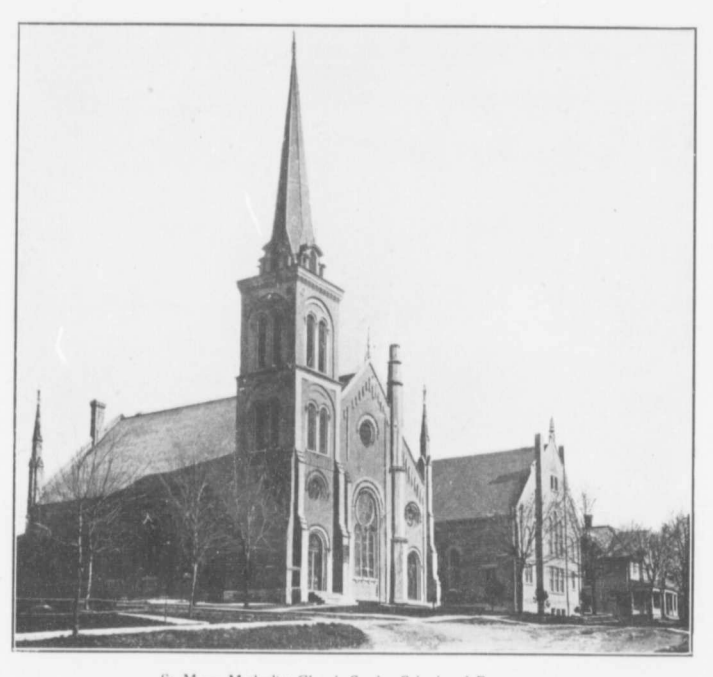
St. Marys Methodist Church, Sunday School and Parsonage.