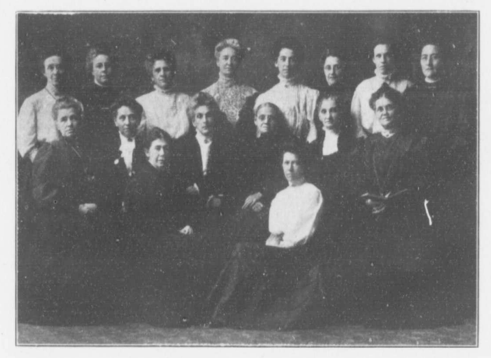
The Woman's Missionary Society, 1908