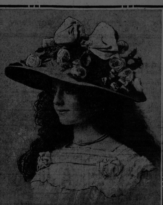
ROSE TRIMMED HAT FOR A LITTLE GIRL.

This charming hat for a young girl is of moss rose seems to emanate from the centre of the crown where there is a little crisp bow of pink flowered Dresden lace.