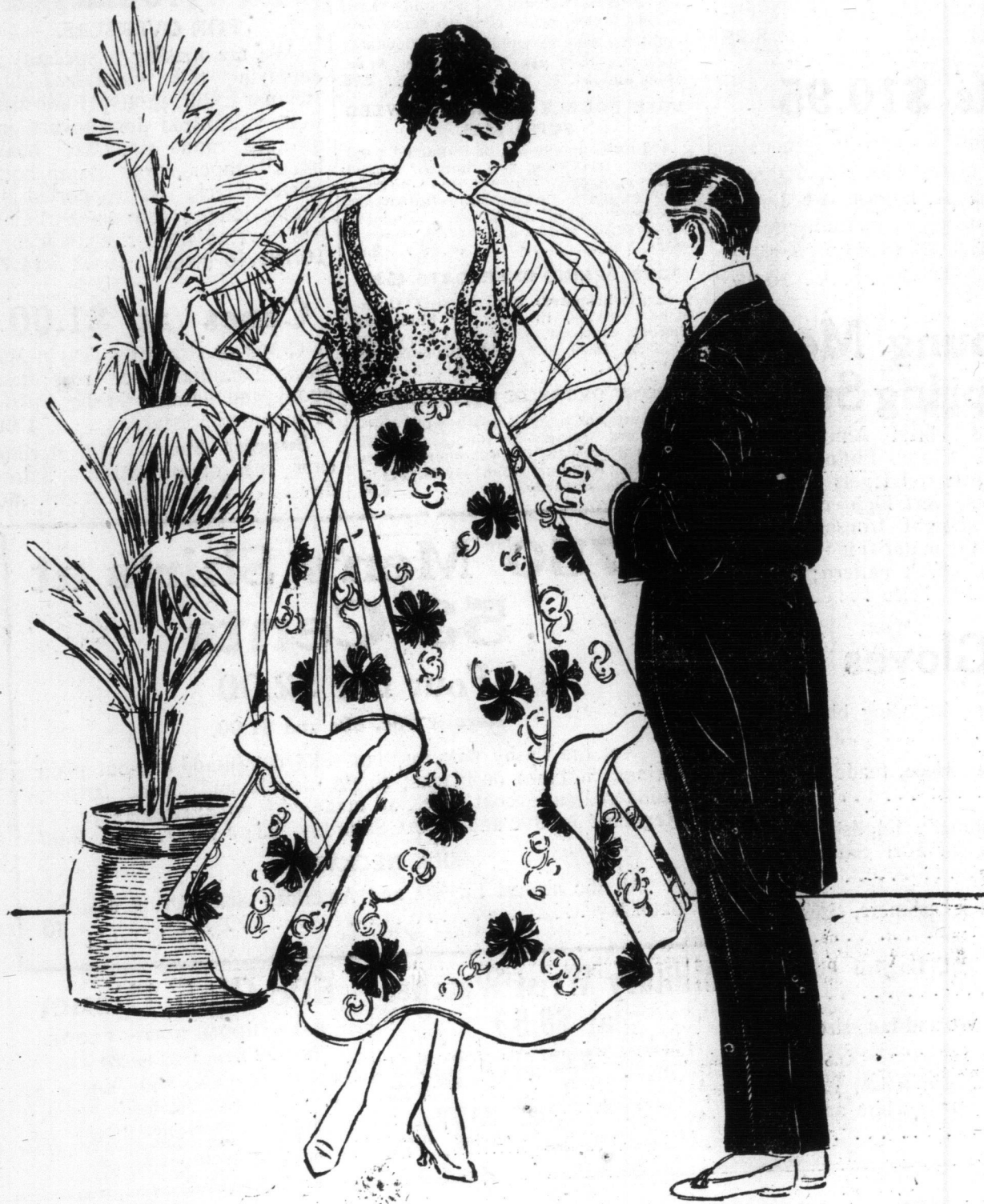
AN EMBARRASSING MOMENT When You Find That the Girl You Promised Your Mother You Would Ask to Dance Is Just One Head Taller Than Yourself.

"Better Milk for Every Hour from the Spotless Dairy Bathed in Sunshine"