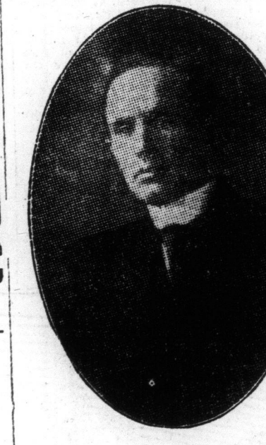
Who will speak at Loew's and the star on Sunday at the recruiting league.