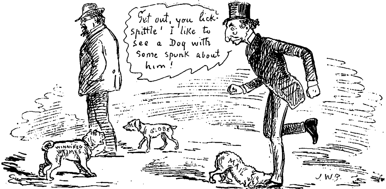
THIS WAS THE UNKINDEST KICK OF ALL.