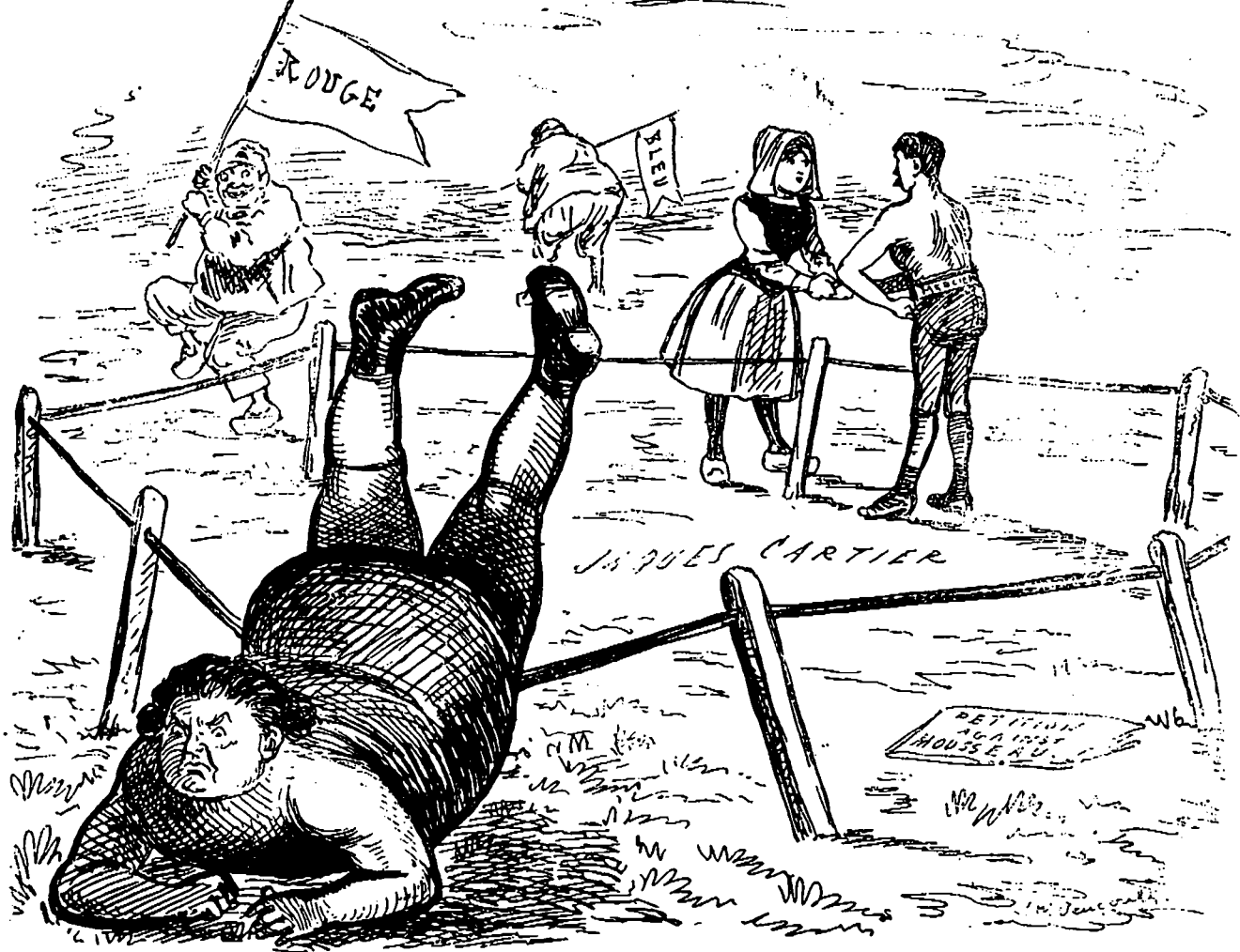
THE GREAT MOUSSEAU-MERCIER FIGHT. MOUSSEAU "KNOCKED OUT!"