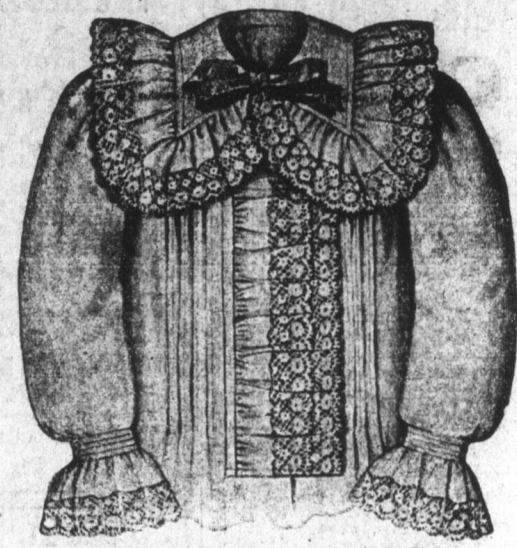
Ladies' Night Dresses.

All kinds of Whitewear and Underwear for the Bride to Select from.