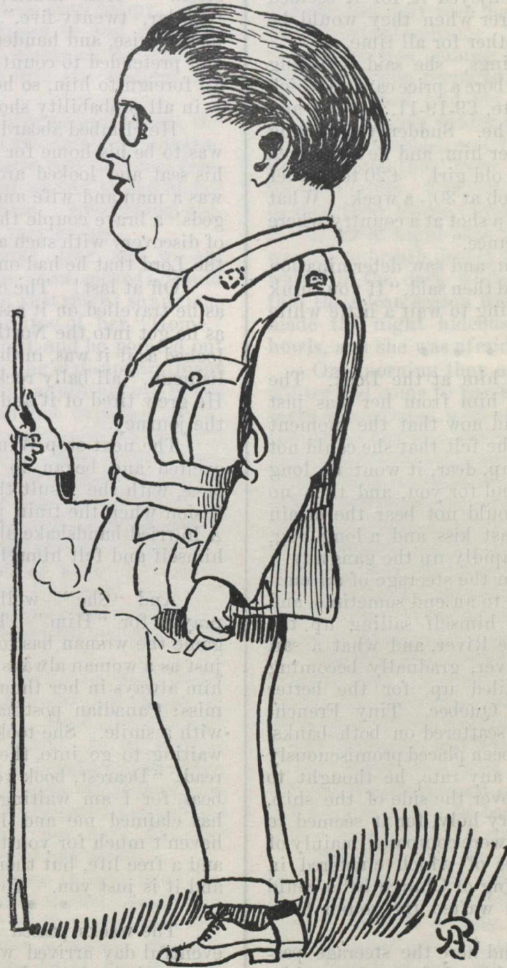
"The Major X."