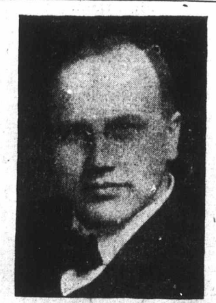
Who addressed the Montreal Publicity Association to-day.

CALL MONEY AT NEW YORK. New York, January 12.—Call money 21/2 per cent.