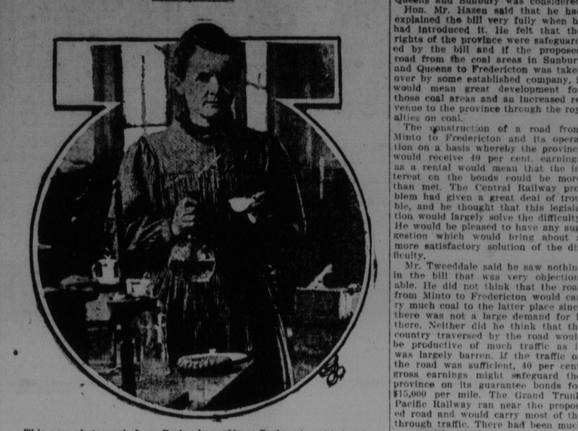
This new photograph from Paris shows Mme. Curie, who with her husband, now dead, discovered radium, at work in her laboratory...