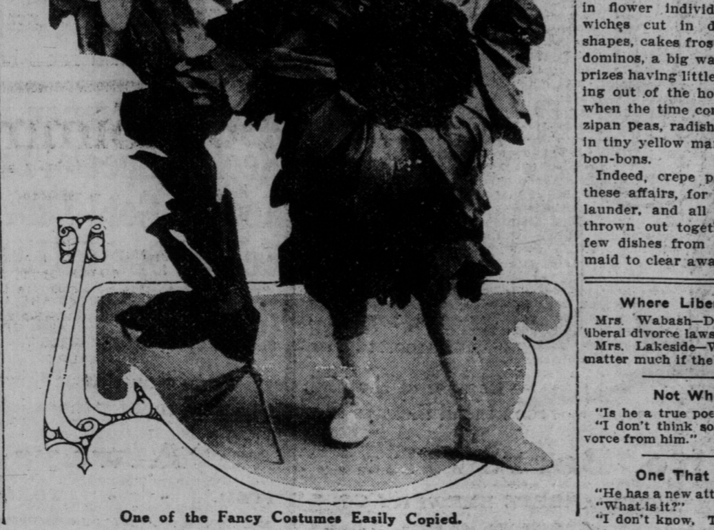
One of the Fancy Costumes Easily Copied.

Perhaps the economical mother may consider it a great deal of trouble to make a dress for one occasion only; but when she takes into consideration the fun it gives in the wearing she will admit the preparation is no more troublesome than seeing to the proper laundering of the lace and cambric dress, the pressing of sashes and half ribbons.