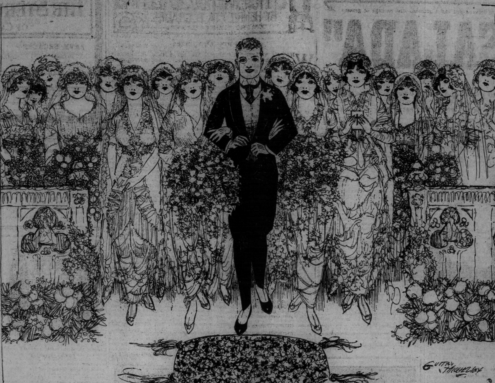
Copyright, 1914, by Newspaper Feature Service, Inc. Great Britain Rights Reserved.

Perhaps the economical mother may consider it a great deal of trouble to make a dress for one occasion only; but when she takes into consideration the fun it gives in the wearing she will admit the preparation is no more troublesome than seeing to the proper laundering of the lace and cambric dress, the pressing of sashes and half ribbons.