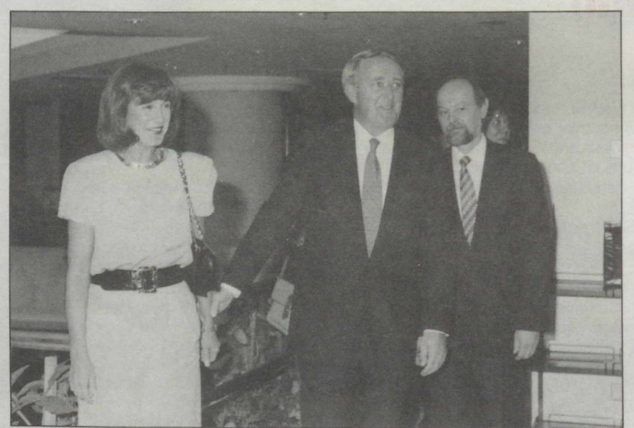
Prime Minister Brian Mulroney with Mrs Mila Mulroney and Canadian High Commissioner Garrett Lambert, during the Commonwealth Summit in Kuala Lumpur

strengthen structured support for the Commonwealth Games, next scheduled to be held in 1990 in New Zealand and 1994 in Victoria, British Columbia, were endorsed by the heads of government, as was a Canadian initiative to strengthen the role of the Commonwealth in assisting member countries in respect of human rights. To mark the 40th anniversary of this august organization, Canada also donated 40 scholarships for deserving Commonwealth students.