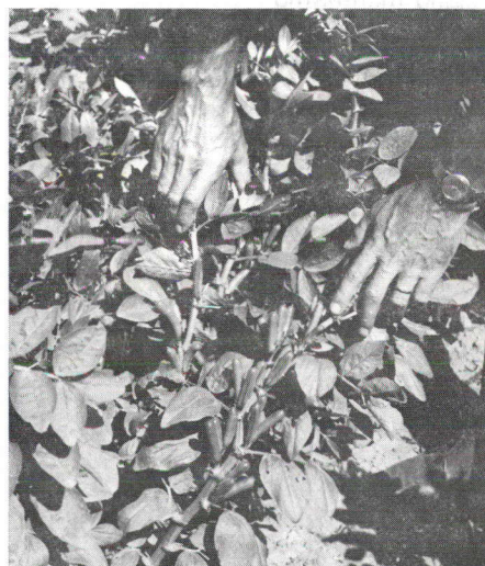
Canada Agriculture photos Fababeans growing in Lethbridge, Alberta.

Fababeans could well help to arrest malnutrition in countries where agricultural lands are not as productive as Canada's.