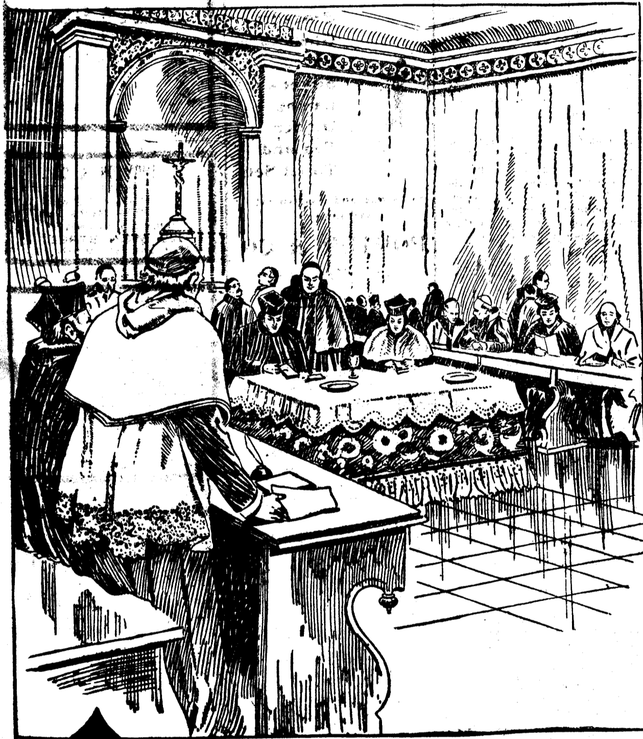
THE COLLEGE OF CARDINALS BALLOTING FOR POPE LEO'S SUCCESSOR AT THE VATICAN.

Upon being asked who was likely to be the successor of Leo XIII, we had repeatedly answered that no human prediction in this wise could be credited. We were right, for few there were who would have thought Cardinal Sarto to be the