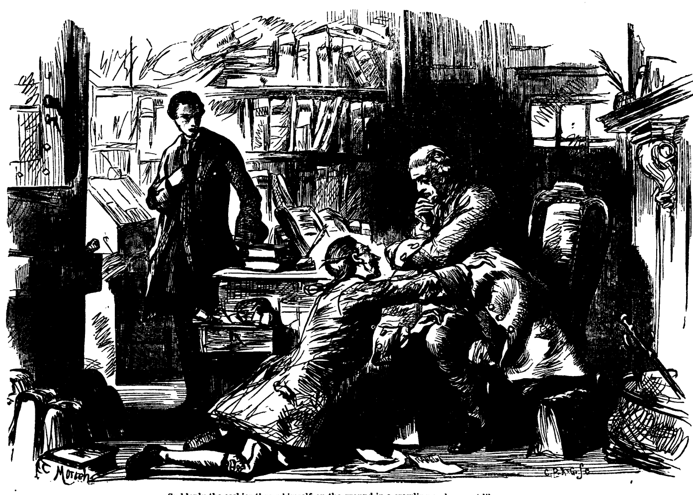
Suddenly the cashier threw himself on the ground in a crawling and serpent-like manner.