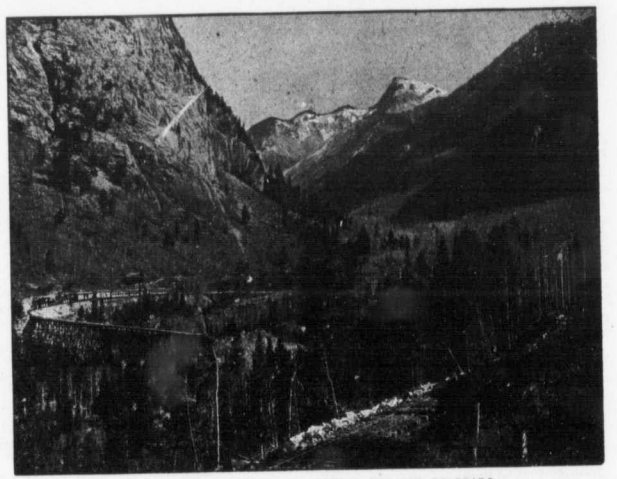
OPHIR LOOP, DENVER AND RIO GRANDE RAILWAY, COLORADO.

TAKE it for granted that you are in business, either as your own master or as the servant of another, and that hammer or yard-stick, paint-brush, pen, or plough, are not unfamiliar to