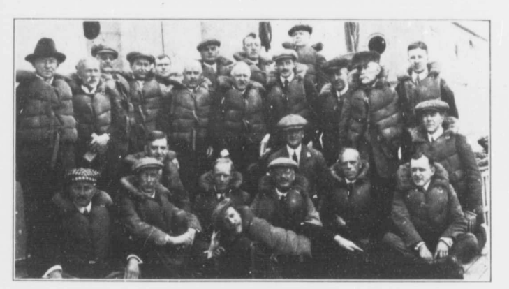
Canadian Press Party on board transport S.S. Metagama