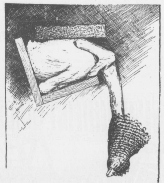
Chicken in the shaping board.

The appearance of the bird lies chiefly in the hands of the producer and it is natural for the dealer to wi h that appearance to be attractive. On completion of plucking and before the joints become set, fold the legs and wings closely to the body and place the bird breast down in a "shaping board." This board may be made of two pieces of 1 by 6 inch lumber nailed at right angles. A two or three pound weight is then placed on the top of each bird—an ordinary building brick is suitable for this purpose. The bird is left in this position until thoroughly cooled, when an attractive appearance is the result of shaping.