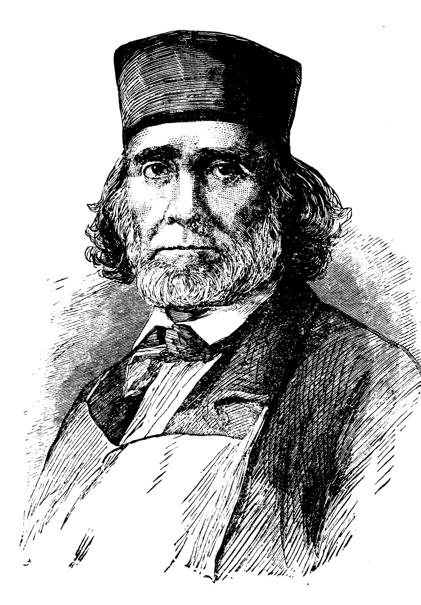
HIRAM POWERS, THE AMERICAN SCULPTOR.