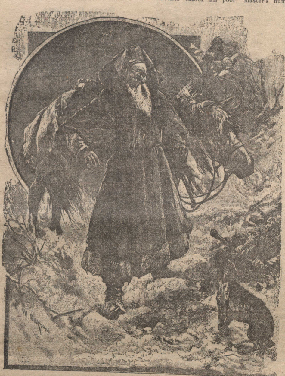
THE TRAVELLER DISMOUNTED AND FOLLOWED.

'To be ignorant is to be dangerous. The ignorant man, though he be but one, can make of no account the wisdom of many men. After the wise of many generations have been striving to teach a people wisdom, a knave or a fool may come and cry aloud. "There is no god but ourselves, there is no law but our own desires, there is no hereafter but the grave which we share with our sister the worm and our brother the dead