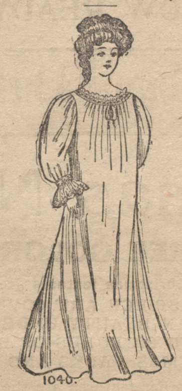
LADIES' AND MISSES' NIGHT DRESS .-

ty blouse with these bloomers. The pat is in six sizes, 5, 6, 7, 8, 9 and 10 years. The pattern