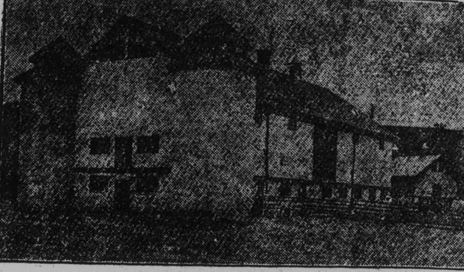
THE FINEST COW BARN IN ONTARIO.

This barn on the Eglington farm of Mr. Joseph Kilgour, one of Toronto's prominent business men, is the finest home for cows in On-The walls of the silos and stable are hollow concrete. barn is equipped with every modern labor-saving device, such as machinery for automatic watering of the animals. One man can attend to 60 cows without help, except for milking. The stable is also splendidly located.