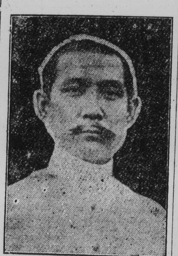
SUN YAT SEN.

Sun Yat Sen remained a prisoner for some days until, by a letter in