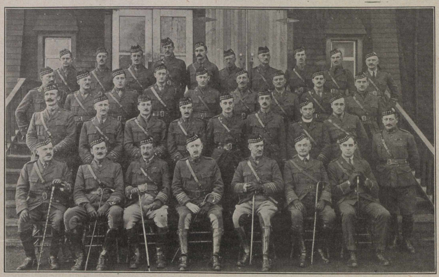
OFFICERS OF 67TH BATTALION, "WESTERN SCOTS," C. E. F.

The manager of the Empress says the Pipe-Major is the most liberal man to deal with that he has ever met. He was so pleased about the satisfactory dance arrangements the Pipe-