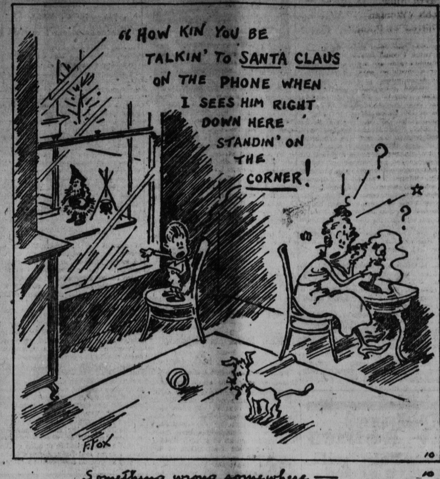
Something wrong somewhere