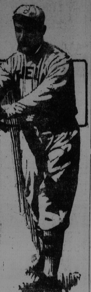
NAPOLEON LAJOIE, WORLD'S GREATEST BATTER.

At the plate Lajoie is the personification of carelessness. He bats right-handed, and generally swings the bat in his right hand until he is ready to swing. Then he grasps the bat with both hands as the pitcher winds up. If the ball suits him he steps forward to meet it, throwing the