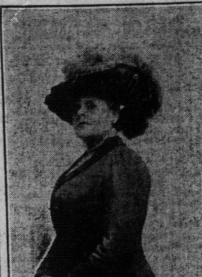
MARIE DRESSLER In "Tillie's Nightmare," at the Royal Alexandra next week.

Y.M.C.A. in Far East. Nearly $2,000,000 Raised in America to Occupy Strategic Points. NEW YORK, Jan. 11.—John Wansamaker has just promised to erect his sixth Y. M. C. building in the far east. It was announced to-day at the international headquarters here that he had pledged $50,000 to provide a Y. M. C. A. building for Peking, China.