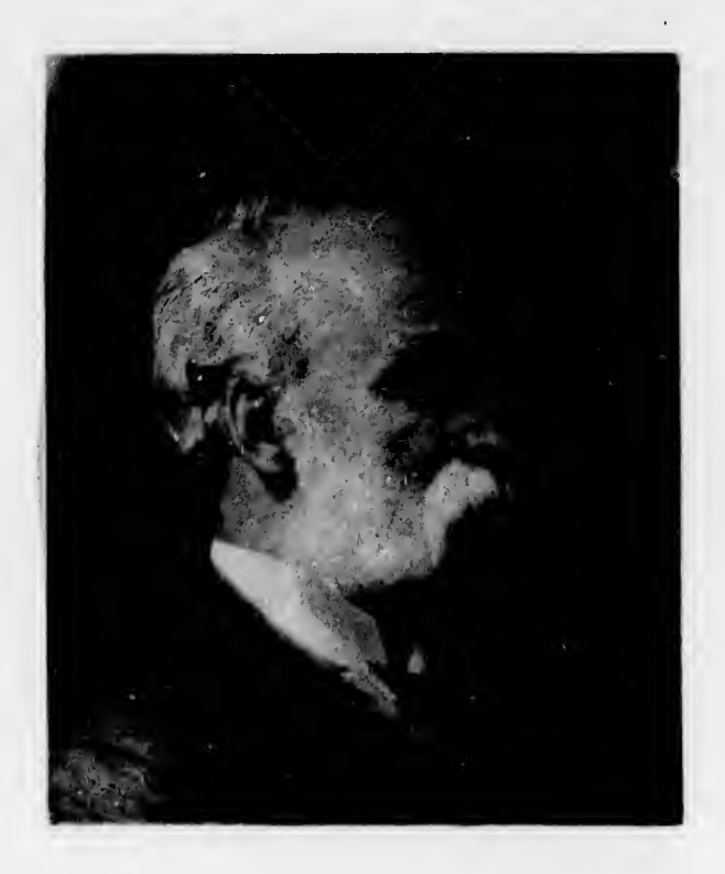
See Page 20.