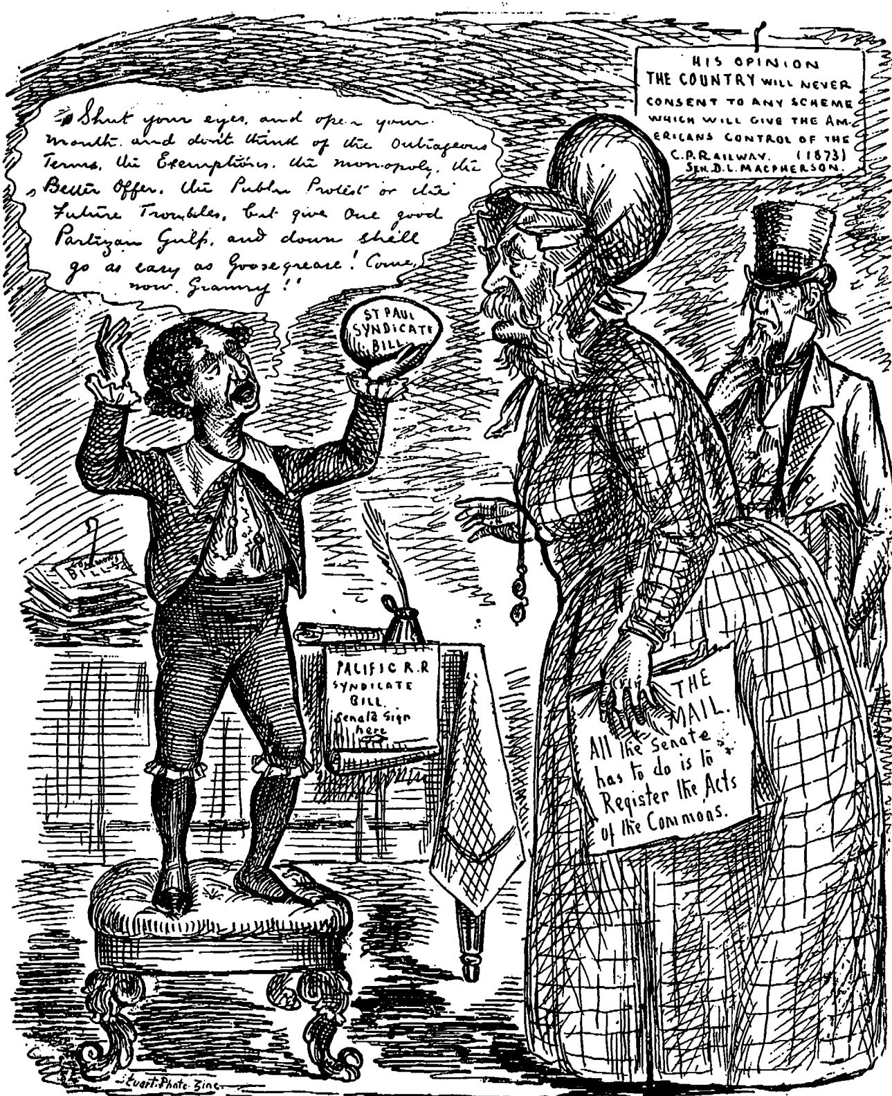
TEACHING HIS GRANNY TO SUCK A BAD EGG.