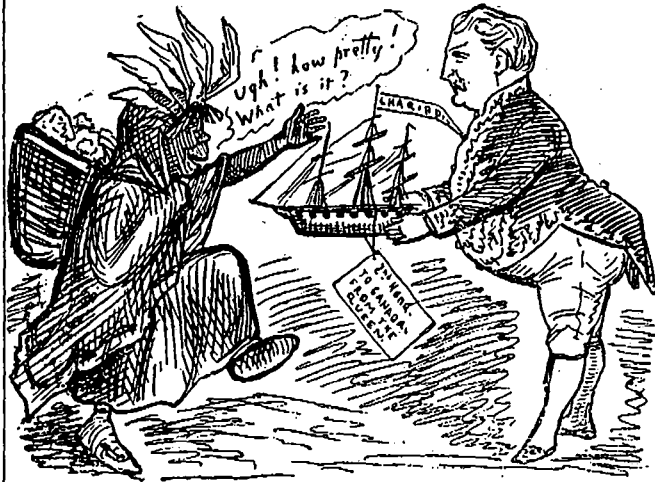
JOY OF THE SIMPLE MAIDEN, CANADA, ON RECEIVING A PRESENT FROM HER GREAT MOTHER.