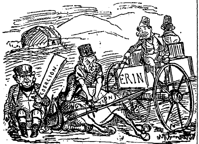
RELIEVING THE IRISH HORSE,—JOHN BULL SITS ON HIS HEAD WHILE GLADSTONE CUTS THE HARNESS.

GREAT REDUCTION IN PRICES. Postal Card Size, $1.00. Note Size, $2.00. Letter Size, $2.00. Foolscap Size, $4.00. One Bottle of Ink with each Lithogram. Agents wanted in every Town. BENGOUGH BROS., Agents, Next Door Post Office, Toronto.