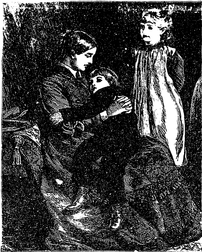
THE SICK BOY.—(see third page)