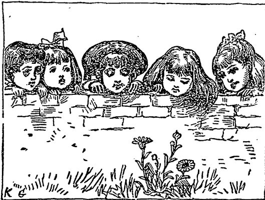
OVER THE GARDEN WALL.