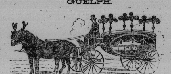
(Cut of our new Hearse.)