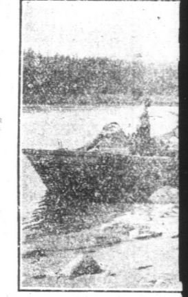
LOADING EREIGHT. tracked up the rive

the Chutes down to Cl Lake Athabaska steame to Fort Smith on the Sla also back up from Chipp McMurray. From Chippe ers also go across Lake Fond du Lac. Below the Point Providence the riv a limestone ledge spread great width and causing in low water.