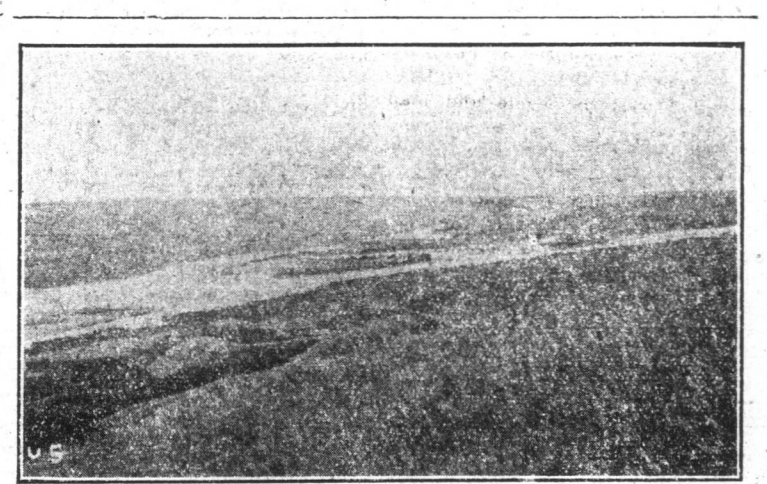
VIEW OF THE PEACE RIVER VALLEY from the summit of the hill overloking the river-This picture shows the junction of the Big Smoky with the Peace River-The banks of the river are 1,200 feet high.

At Griffin Creek a new settler was found digging a well on his new trail is very bad in wet weather. Grouard to Peace River Crossing the dressed 1,060 olbs., and a three year old dressed 858 lbs. These lived on The whole family Mr. Kerr had visited the Peace straw piles and native grasses, and