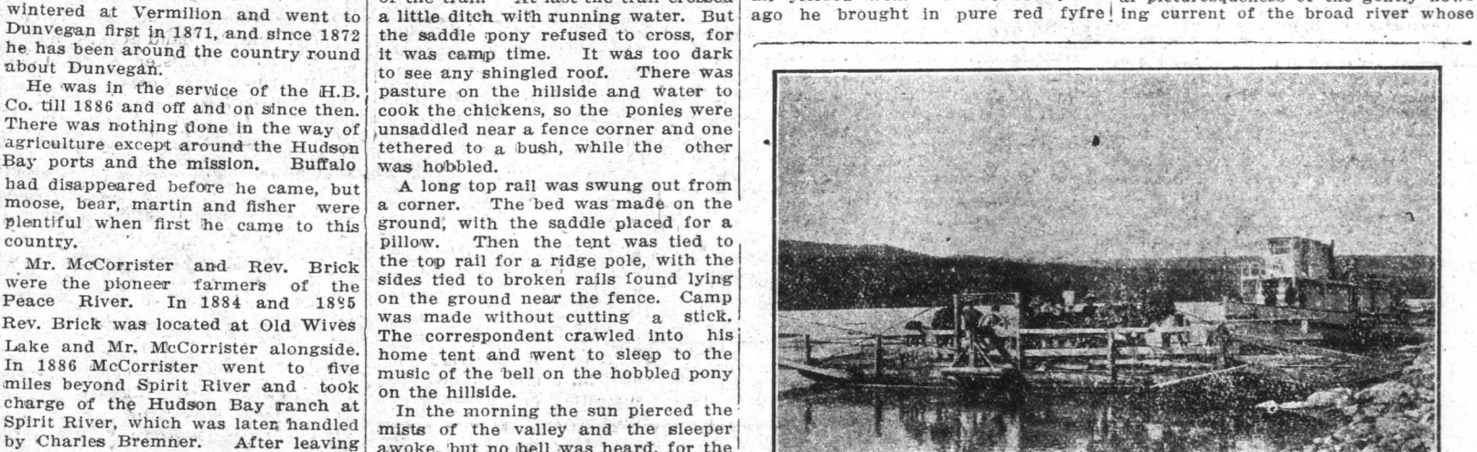
GOVERNMENT FERRY AND STEAMER ST. CHARLES at Peace River Crossing-The river at this point is three times as wide as the Sask-

seed grain and has been sowing from current is divided by islands near the to the country and tells a good story only a few hundred yards round the that ever since. American Banner confluence of the Smoky river, whose