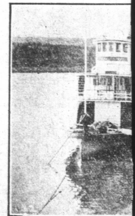
Crossing, Returning and en route to Fort