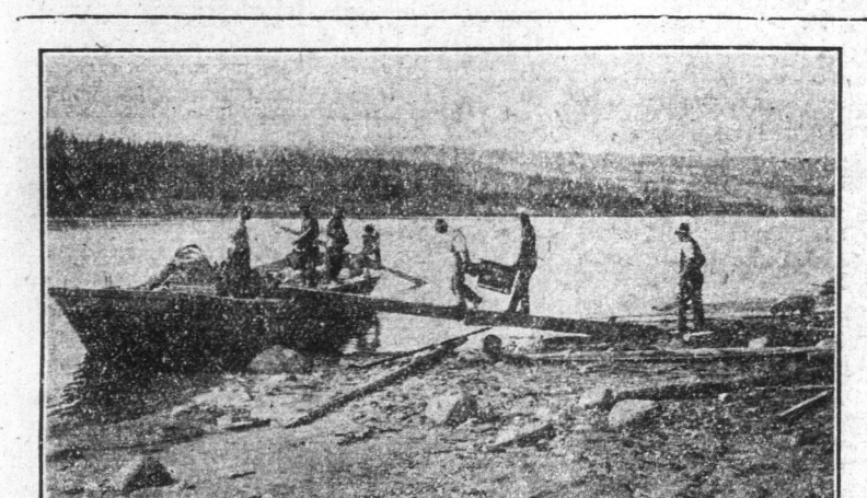
LOADING FREIGHT SCOW at Peace River Crossing-The scow was then tracked up the river to Fort St. John, nearly 200 miles distant.

Bears and Beavers at Dunvegan. plus rainfall from Grande Prairie Dunvegan ferry, the Bulletin correseventually drains into the Big Smoky pondent visited the new settlements river, which joins the mighty Peace along the north of the Peace as far as near Peace River Crossing, when the the ferry at Peace River Crossing. The Peace River is navigable from tion of the big basin of the River of the canyon above Hudson's Hope, Peace. But this district includes the