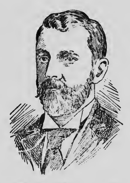
HON. W. S. FIELDING (FINANCE).

Speech delivered by Hon. W. S. FIELDING, Finance Minister in the House of Commons, Dec. 3rd, 1907