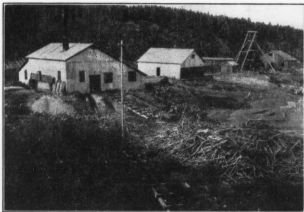
Plate V.—Pueblo mine, Whitehorse Copper camp, showing surface equipment and buildings.

pyrite. The copper percentage varies greatly in different parts of each deposit, but the general average is between 3 and 4 per cent. The gold and silver are negligible in some of the ore bodies and important in others. Hematite masses are much less common than the magnetite bodies, the deposits on the Pueblo property being the only large bodies so far discovered. (Plates V, VI.) These differ from the magnetite ore bodies principally in the greater oxidation of the copper minerals. Deposits characterized by the garnet-augite-tremolite gangue are numerous wherever the lime-granite contact is exposed. They vary from low grade deposits containing only a sprinkling of copper minerals to considerable lenses of valuable ore. The valuable minerals are similar to those in the iron masses and consist mainly of bornite and chalcopyrite. On one property, bornite is absent however, and chalcopyrite is associated with mispickel. The siliceous ores contain, as a rule, a higher percentage of copper than the iron ores, those shipped up to the present time averaging probably over 8 per cent. The precious metal contents are moderate, seldom exceeding $3 per ton.