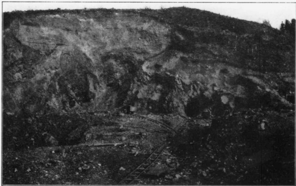
Plate VI.—Pueblo mine, Whitehorse copper belt, showing face of huge open cut, from which was obtained the ore of the first important shipments from this property.