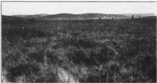
Plate VIII.—Typical stretch of meadow land near head of Nisling river.

valuable to stock wintering out, as the grass heads retain their seed which remains quite preserved and consequently highly nutritious. Thus animals can readily live on the grain heads where snow is too deep for the grass stocks and blades to be reached.