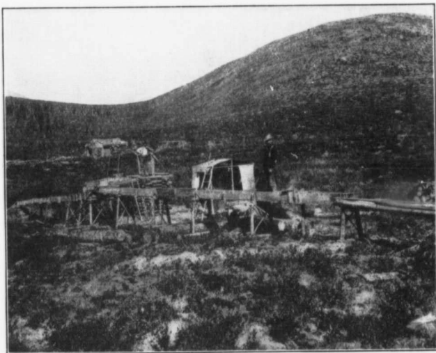
Plate III.—Placer mining on South fork of East fork of Nansen creek by underground drifting and sluicing, summer of 1914. The gravels are hoisted to surface by windlass summer and winter, and sluiced during summer months.

Between 1906 and the close of last year (1914) about $36,000,000 or slightly more than this amount was obtained from the Klondike gravels, making a total of $155,000,000 which corresponds with the writer's estimate.