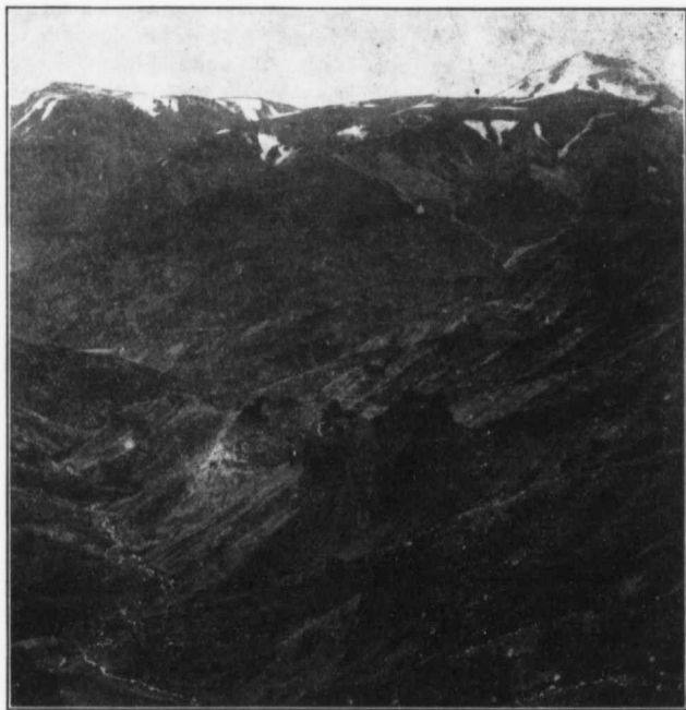
Plate VII.—Huge amphitheatre in Duke River coal area, Klwane district, in which at least twelve seams of coal exceeding one foot in thickness, are exposed.

The beds found to be coal-bearing in Yukon occur in at least 19 distinct areas. In 14 of these, coal of economic importance