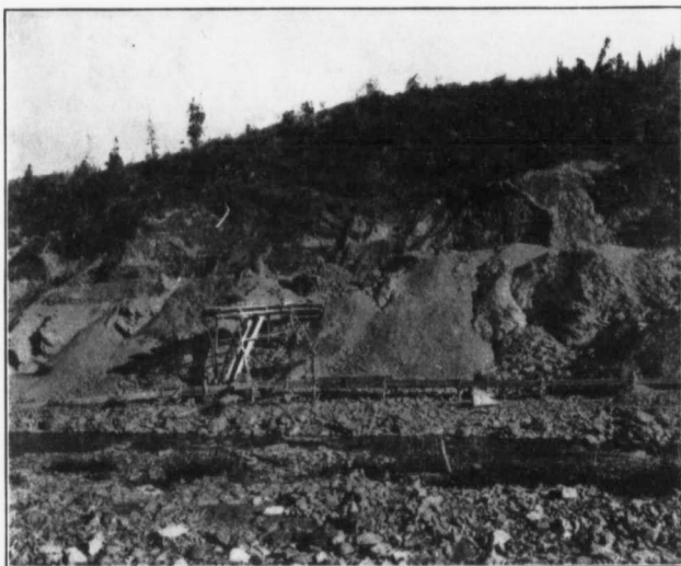
Plate IV.—Working high level old channel gravels on Burwash creek, Klauene district, summer of 1914. Gravels cleaned off bedrock are wheeled in barrows to tipple and dumped into sluice boxes below.

as 10 years more may be required, but just how far the operators there can go with their present equipment is problematical, depending largely on the amount of thawed ground remaining unworked. It is to be expected that the mining operations and production throughout the district will gradually diminish in extent and amount as the task of exhausting the gravels of their gold content nears completion. New discoveries of more or less importance may be made, however, which will tend to somewhat lengthen the productive life of the district.