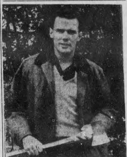
READY FOR ACTION-Lyndon ng Hitch-hikers. The fact Gray, this year's "Bull o' The Continued on page six Woods".

Owing to the mysterious disap-pearance of the rope on Tuesday night, the final tug between the fifth year boys and the fourth year Continued on page six