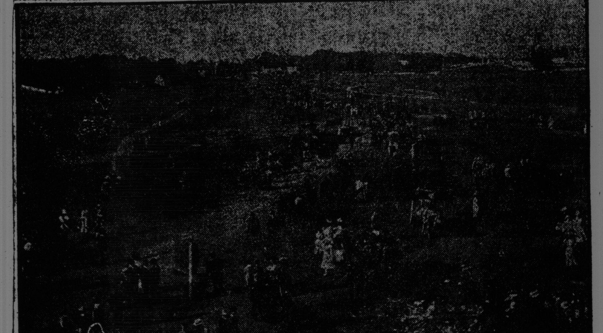
Sunday scene on Plains of Abraham at Quebec.